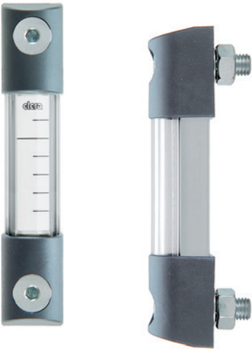
ELESa Original design

Packing rings in special material depending on the customer's needs.