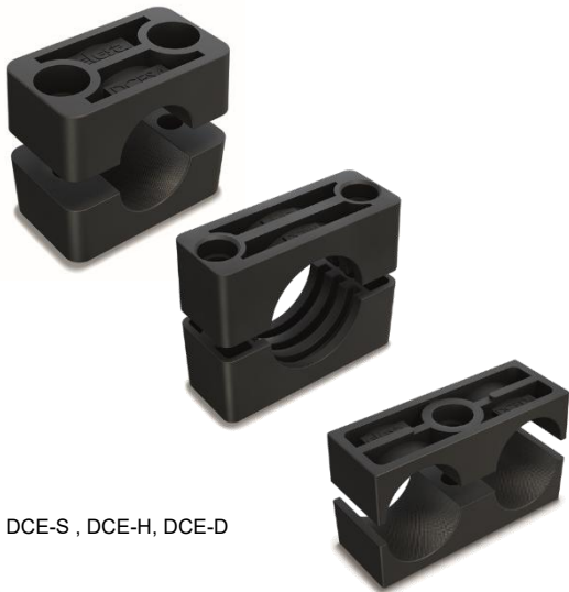
DCE-S , DCE-H, DCE-D